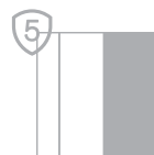
5 Years capacity warranty